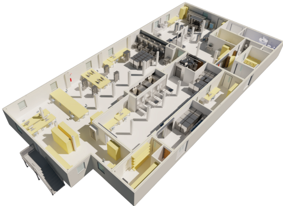
Unit large (furnished)